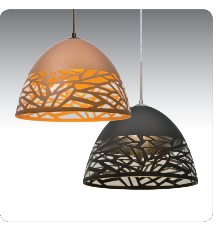
COPPER (KIEVCP) WITH BRONZE FINISH & BLACK (KIEVBK)

All dimensions provided are nominal. Allowance must be made for dimensional tolerance in handcrafted glasses.