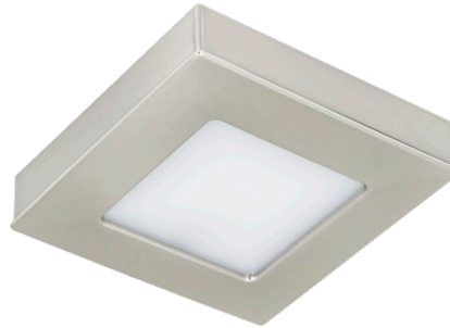
Tunable Omni Square - Nickel 3W / 145Lm OMNI-TW-S1-NK