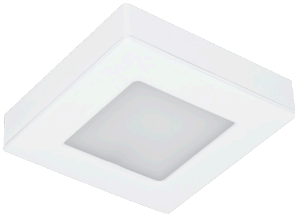
Tunable Omni Square - White 3W / 150Lm OMNI-TW-S1-WH