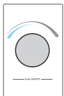
Push Dial Controller (Single zone)