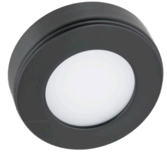
Tunable Omni Round - Black 2.8W / 126Lm OMNI-TW-R1-BK