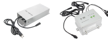
LED-RGB-15A-24V (Requires LED-RGB-CTRL-24V) LED-RGB-CTRL-24V (Requires LED-RGB-15A-24V) 24V DC Power Supply & RGB Controller 10A DC driver with 5ft power cord has mating connector for RGB controller; Allows for run lengths up to 65 feet; Must be used together