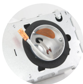
Direct snap power connector